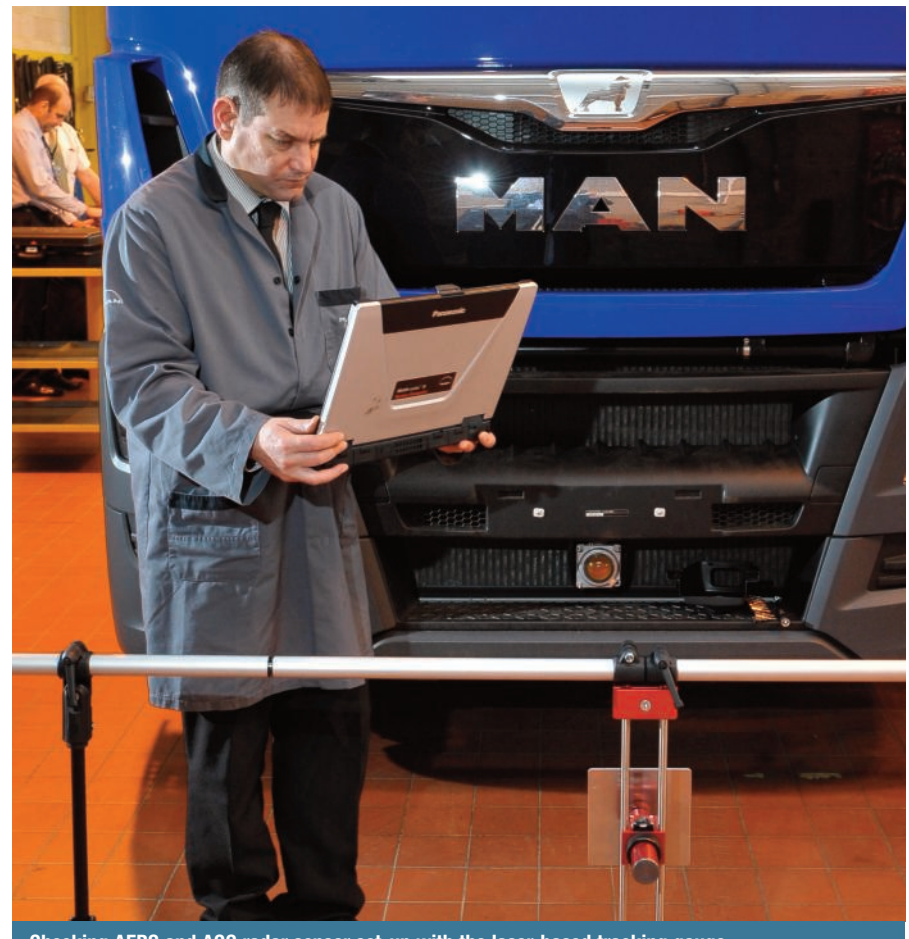
Checking AEBS and ACC radar sensor set-up with the laser-based tracking gauge

Note that while the EDC cannot function properly if a vehicle stops with ignition off over the brow of a hill – since fuel consumption moving off downhill will be low, so the system will assume low load – in fact, the preset start condition is